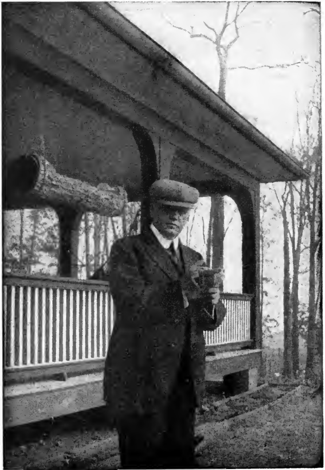
O. Henry in Asheville. A hitherto unpublished snapshot